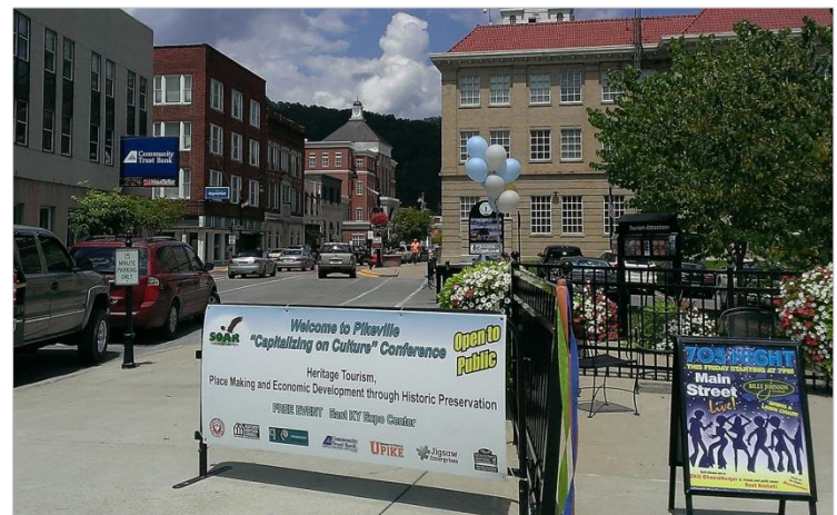
Pikeville Main Street Program