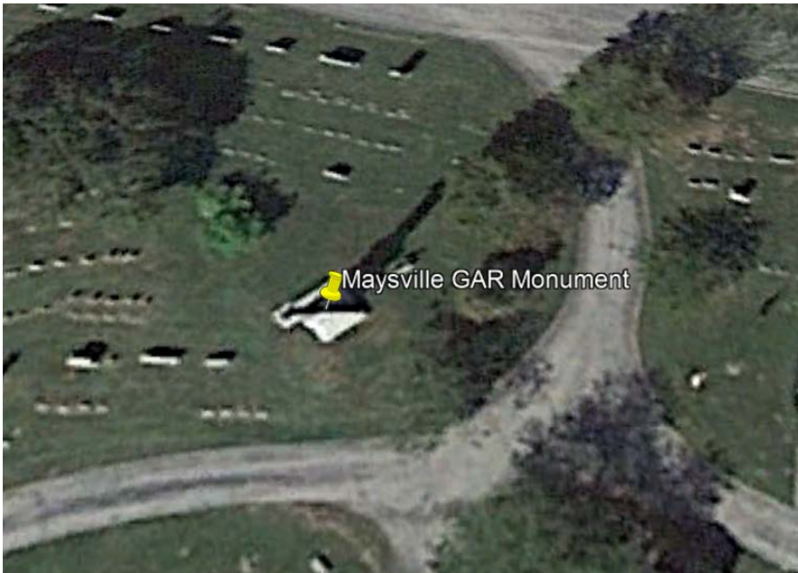
Maysville GAR Monument, Maysville Cemetery. Latitude: 38.637947° Longitude: -83.730452°

The G.A.R. (Grand Army of the Republic) Monument (MS-471) standing in the Maysville-Mason County cemetery is the most outstanding structure on the cemetery grounds, and visible from well outside the cemetery walls. The 42-foot monument was erected by the Joseph Heiser Post of the G.A.R., the largest national veterans' organization following the Civil War, and dedicated on July 4, 1887 on land donated by the Maysville Cemetery.