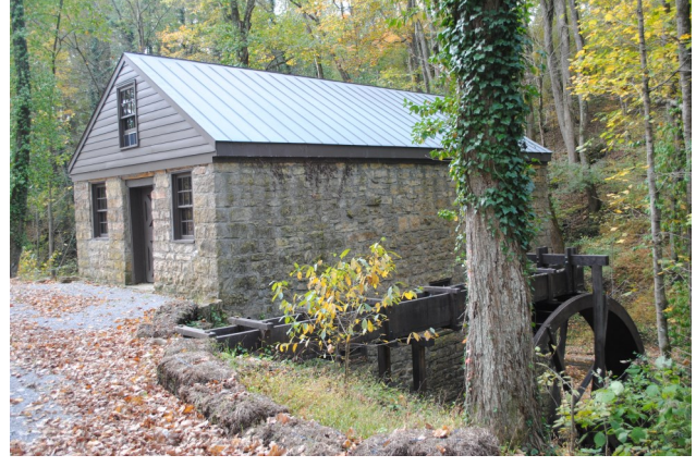
Wolf Pen Branch Mill Farm, Jefferson County, KY

Prior to conducting an easement inspection, a KHC staff member will reach out to each property owner either by email or phone to schedule a convenient time for the inspection.