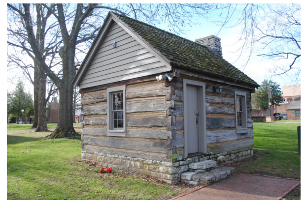
Constitution Square, Boyle County, KY

Thank you for helping protect Kentucky's historic resources!