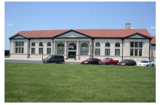
Bowling Green Rail Road Depot, Warren County, KY

For more information regarding potential tax benefits of donating an easement, please visit the National Park Service website at <u>www.nps.gov/tps/tax-incentives.htm</u>