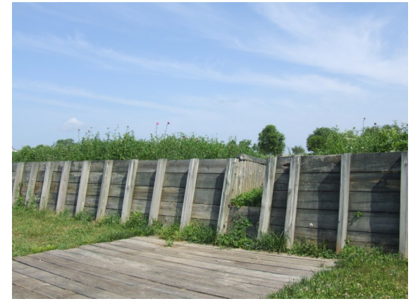
Earthworks at Camp Nelson, Jessamine County, KY

The easement remains with the property whenever ownership changes hands, binding not only the current owner but all future owners as well. In some cases, an owner who donates a historic preservation easement may be eligible for tax benefits.