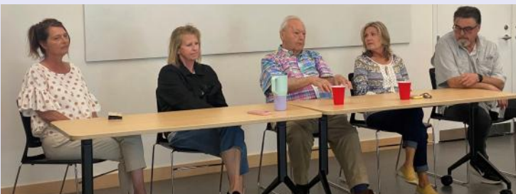
Experienced directors, 10 years or more, shared their “what I wish I had known” and “what I’d do differently” with a Q&A session for directors.