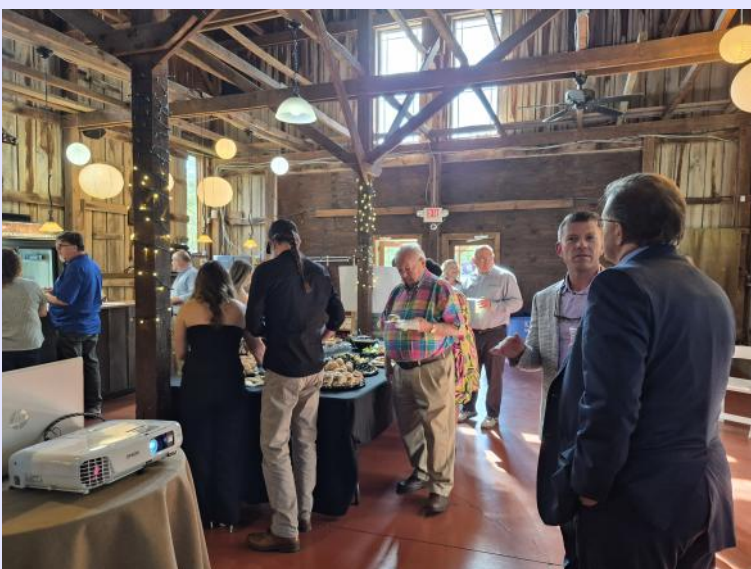
The Venue was lovely and Bree's Kitchen was our caterer.