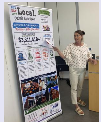
Projects are not the Strategy! Projects create activity... Strategy creates outcomes!