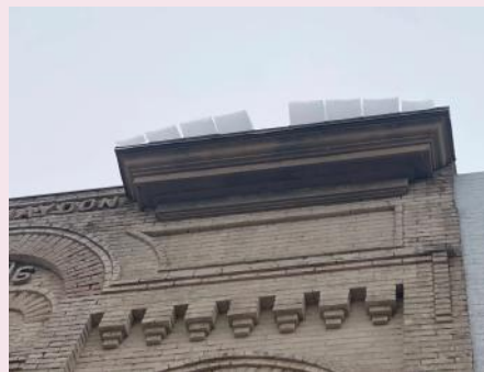
The icy missing tooth smile.

The program is open to IRS-recognized nonprofit organizations, such as those designated 501(c)(3), 501(c)(4) and 501(c)(6), as well as to local governments.