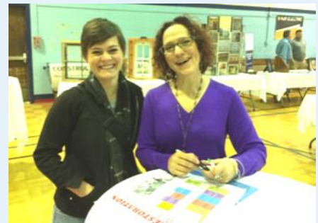
One of the first NKY restoration weekends