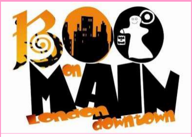
Saturday, October 26, 2019 at 6 PM - 8 PM