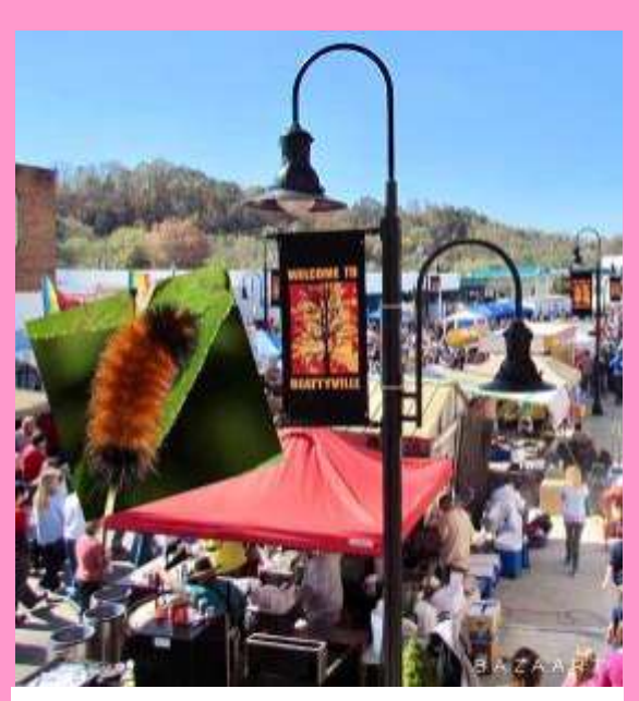
Wooly Worm Festival in downtown Beattyville Oct. 25-27