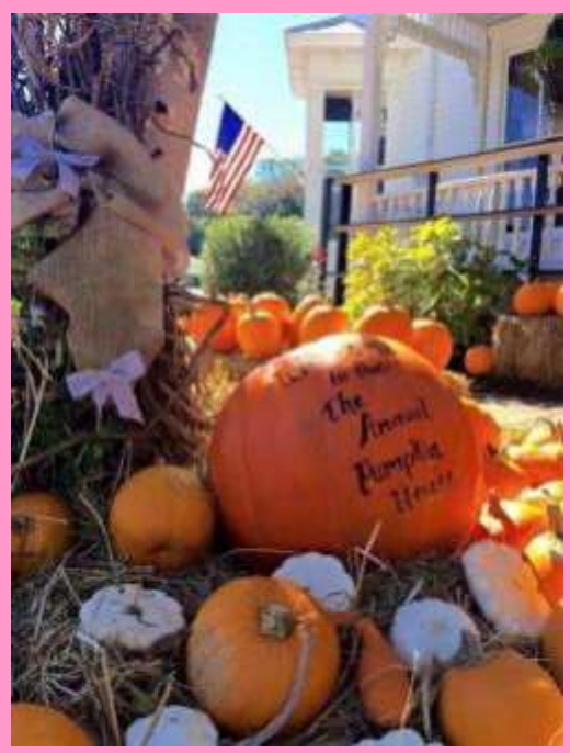
5th Annual Pumpkin House at The Historic Stafford House downtown Paintsville October 26, 2019 at 4 PM – 8 PM

Cool Fall and Halloween activities are taking place across our Main Street!