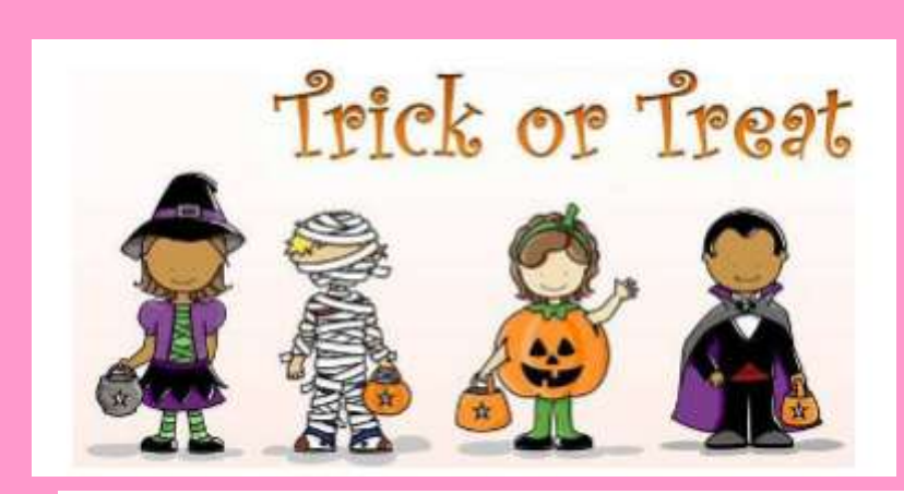
Shelby Main Street in downtown Shelbyville Saturday October 19th 12 PM – 3 PM

The Invasion of the Scarecrows has begun in downtown Scottsville!! Boo Bash is Saturday October 26, 4 pm-8 pm on the Scottsville Square.