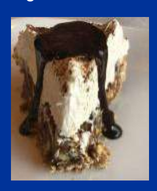
No calories in this pie!

While it airs on Dec. 23, the buzz is already boosting business.