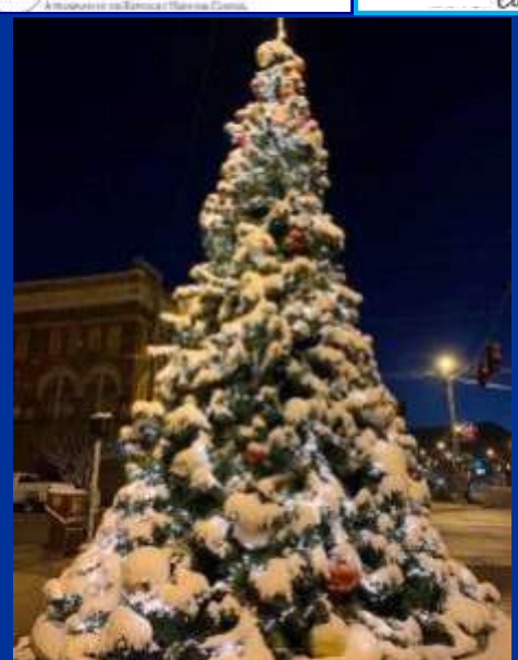
The photo of the Middlesboro Christmas tree is magical.

Winter Conference dates: February 10-12 Awards in the Capitol Rotunda February 12th More info after the new year!