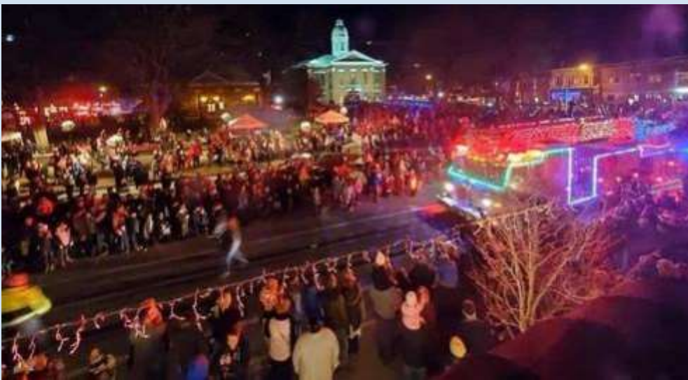
There was a huge turnout for the LaGrange Christmas parade this week-end!