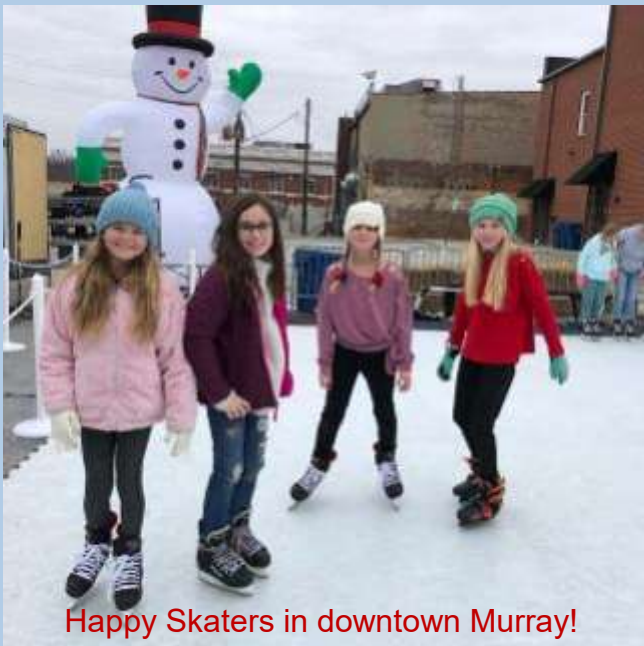
Happy Skaters in downtown Murray!

Contact: Corporation for National and Community Service (CNCS)