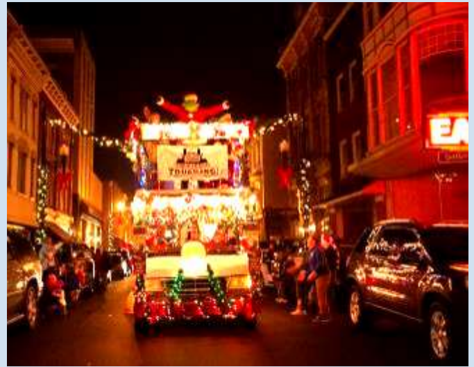
The Grinch came to Maysville, but everyone was excited to see him!