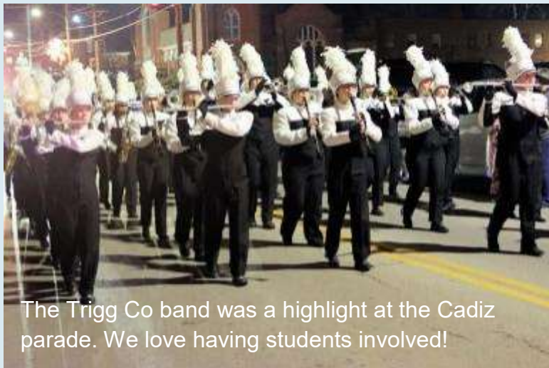
The Trigg Co band was a highlight at the Cadiz parade. We love having students involved!