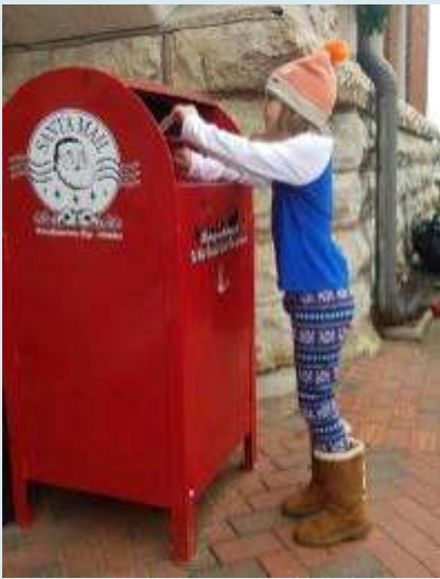
Letters to Santa in Bardstown !