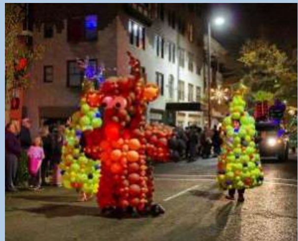
Farmers and Friends in the Paducah Christmas Parade! We love the decorated tractors in our communities!