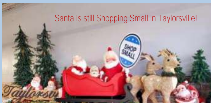
Santa is still Shopping Small in Taylorsville!