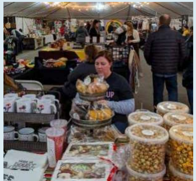
There were a lot of yummy items at the Covington Night Bazaar , but this ice sculpture was the best!