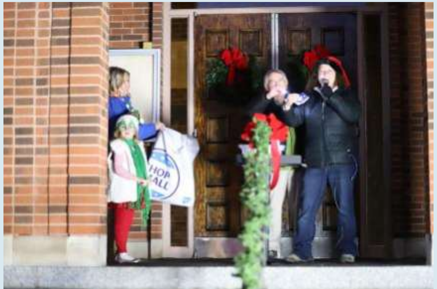
Still Shopping Small in Beattyville!