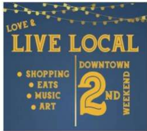
Downtown Maysville, this week-end, Dec. 13-14th