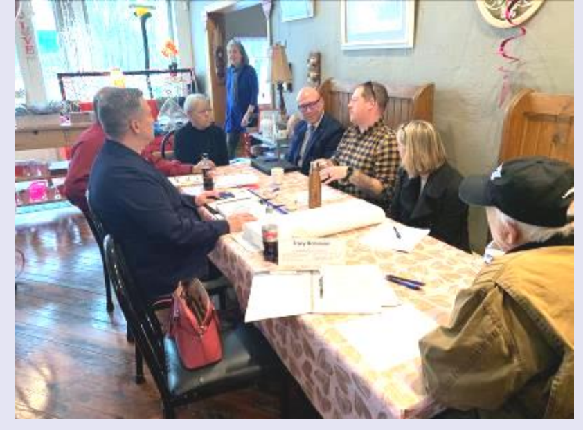
Working together on strategic planning. Directors and community members did a fantastic job of seeing the future of Gratz.