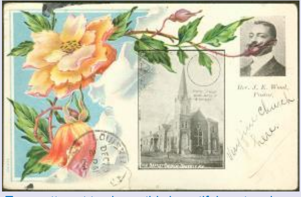
Too pretty not to share, this beautiful postcard from Danville, KY . The date looks to be 1903

will be traveling throughout those counties to provide job training and various other duties. All the best to her in her new role.