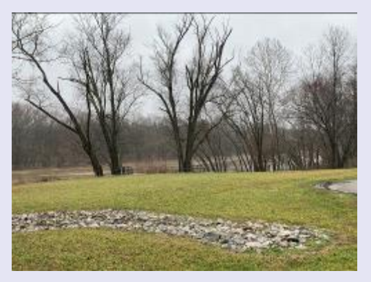
One large asset is that Gratz sits on the KY River. This makes it a prime location for becoming a trail town after infrastructure needs are addressed.

The day began with a walk around town to do an asset inventory. The directors also looked at what might be some lighter, quicker, cheaper, ideas that could be implemented within the next six months.