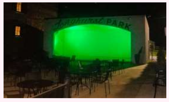
Longhurst Park in downtown Guthrie

As we light up our homes and cities in honor of those we have lost during the Covid-19 outbreak we wanted to share this one from Bardstown Main Street. The MS office is located in the beautiful structure formerly the Nelson county courthouse.