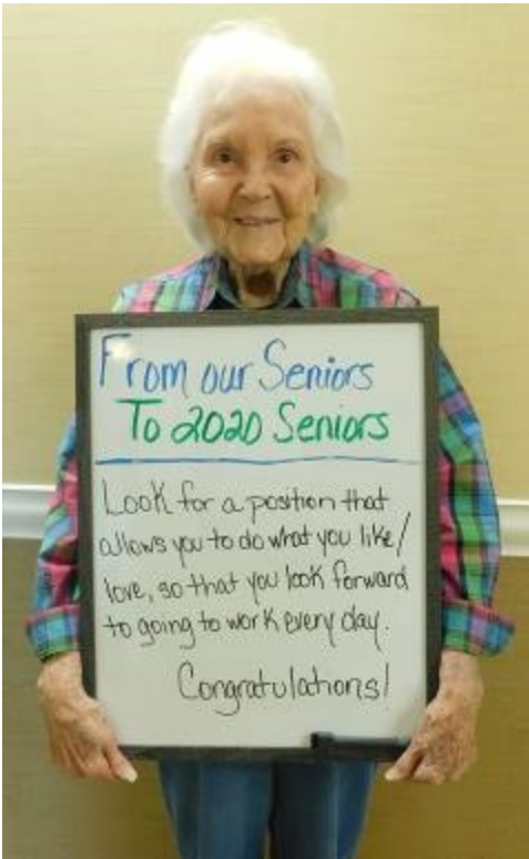
This is one of our favorite ideas that took place in Maysville.