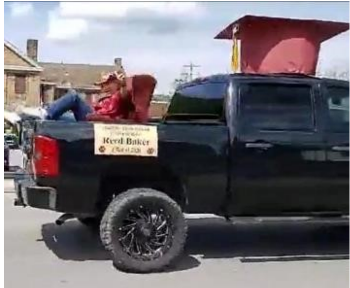
Pineville held a parade. This is a special class as they have been volunteering with Main Street since middle school. This was quite creative. Graduation hat on top and a recliner in the back. A great time was had by all.