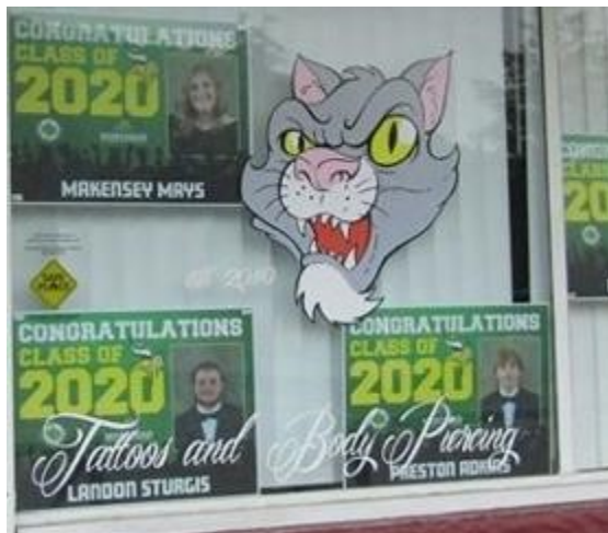
Downtown Morehead and Middlesboro helped to place seniors around town.