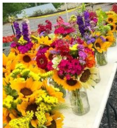
Flowers at the Cadiz market