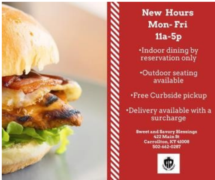
Sweet and Savory Blessings on Main St in Carrollton.

While we are speaking of food, restaurants will be able to open to 50% on June 22 and are still doing curbside and takeout. Here are some offerings around the state that are sure to satisfy your hunger, and great places to take your dad!