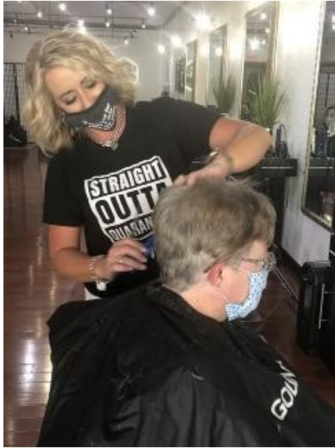
Staying safe in Maysville. Love the t-shirt, Straight Outta Quarantine