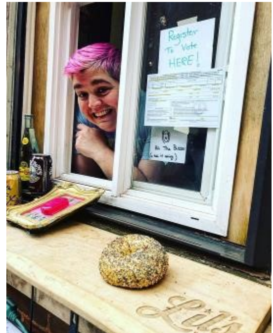
Lil's Bagels on Greenup in Covington has a walk up window!