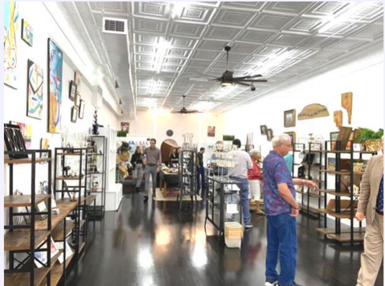
Look at that gorgeous tin ceiling!

We are looking forward to Ike's Pizza opening in downtown Middlesboro a little later this summer complete with patio!