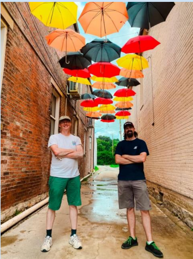
Activating alleys in downtown Cynthiana!