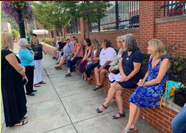
The whole gang listening to Minta explaining some things going on in Pikeville.