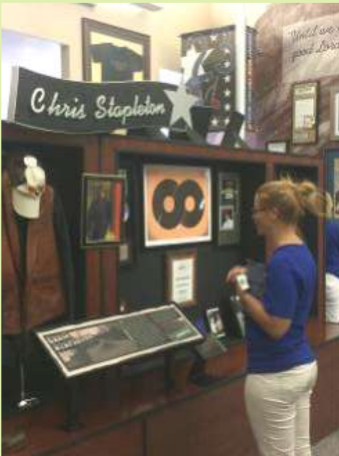
There are many music stars in the region from Loretta Lynn, Tyler Childers, and Chris Stapleton!