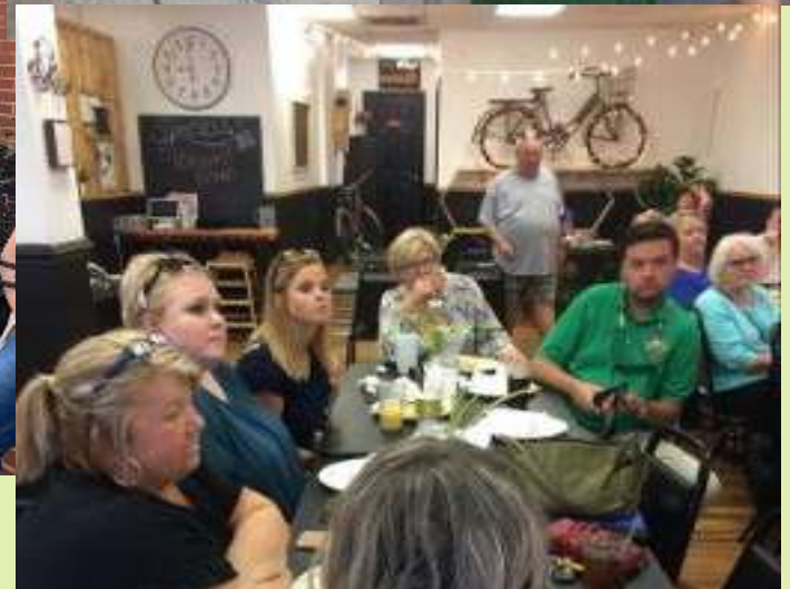
Learning about incentives at Southern Biscuit where we enjoyed breakfast.