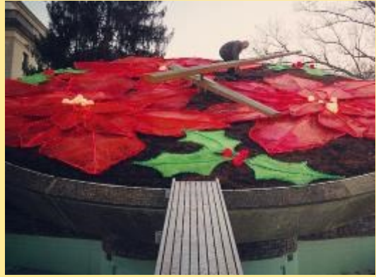
Love the floral clock!

I've included a page of the inaugural preparations in Frankfort as I know many of you will not be able to enjoy them in person. Today is the last day for this Governor's name to be above the door.