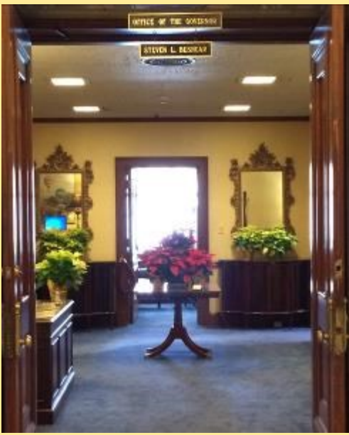
Inside the Capitol