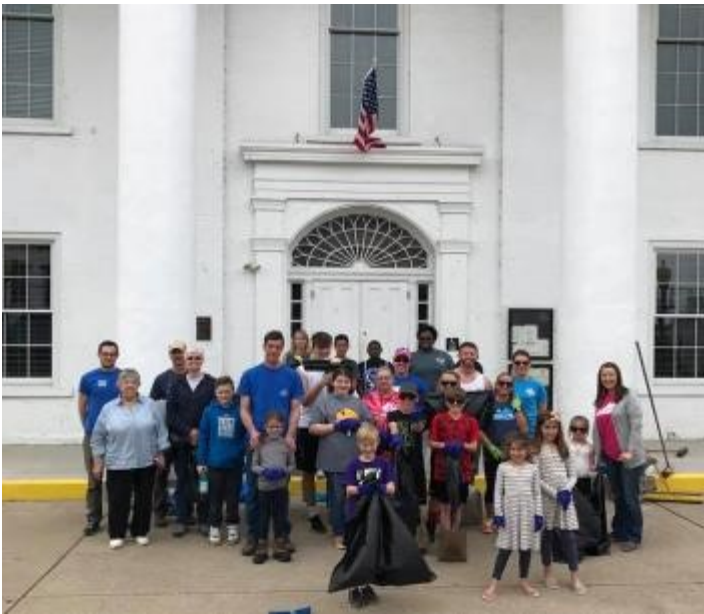
Cynthiana had a great turnout for Main Street clean sweep. This is just a portion of the group, others were still out in their areas cleaning and sprucing up the town!