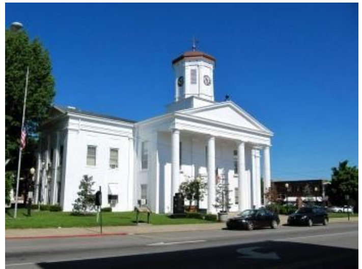
Also want to share a photo of their beautiful historic courthouse that sits prominently on Main Street and where they took their photo. It is still in use and was recently renovated.

Here's a great idea to R & D from Covington for cleanup