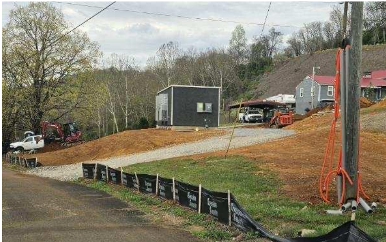
Figure 1. Large structures including staging and access Example - Fiber hut and access

A full literature and records review as described above is required for all such projects. Please include a Section 106 Coversheet as the cover page to your Literature and Records Review and email your documentation to our dedicated Section 106 email address: khc.section106@ky.gov .