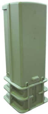
Figure 3. Small placements or attachments Example – above ground pedestal

No individual review is necessary for placement of lines on existing poles or for the placement of small containers as listed above (see image below). Consultants can list these separately within their Literature and Records Review and these projects will likely result in a concurrence with a finding of No Survey Warranted and No Adverse Effect . A corresponding quarterly table shall be provided to our office on the first days of January, April, July, and October.