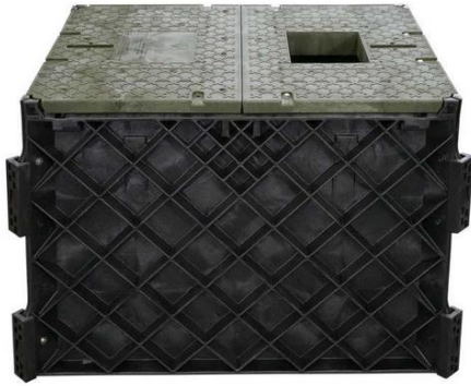
Figure 2 . New buried small structures and lines Example – Buried Vault

Category 3 (Figure 3) – Above ground placement of pedestals, placements of antennas and/or lines on existing structures –