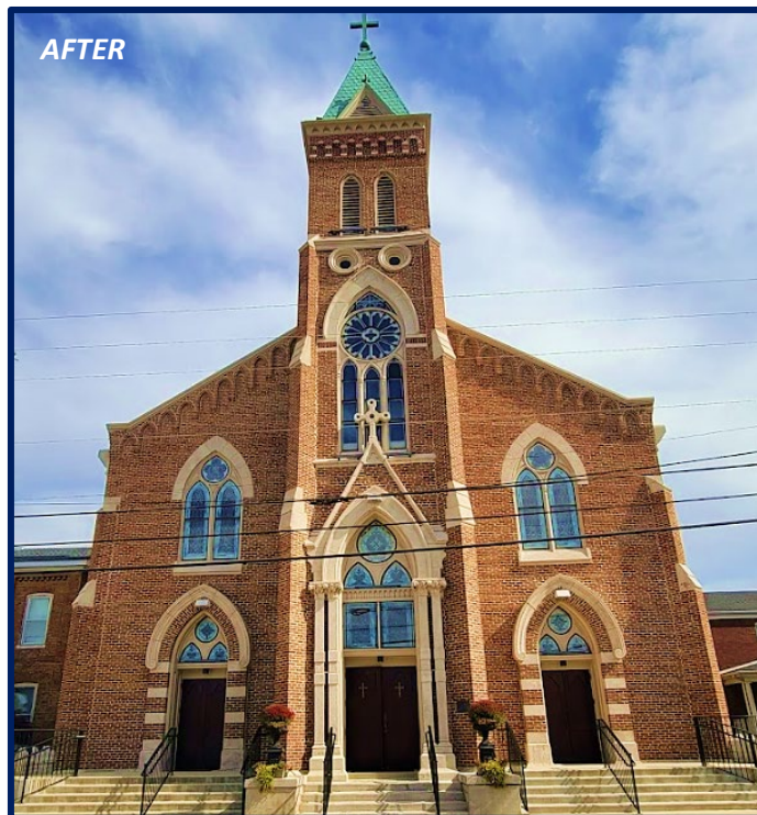
Figures 1 & 2 (Above, Left) – BEFORE the rehabilitation project at St. Joseph’s Catholic Church in Bowling Green, KY. Figure 3 (Above, Right) – AFTER the Kentucky Rehabilitation Tax Credit project was completed, c. 2022. Images courtesy of St. Joseph’s Catholic Church, a 20% State Rehabilitation Tax Credit recipient.