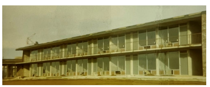
Figure 05: Construction photo ca. 1970