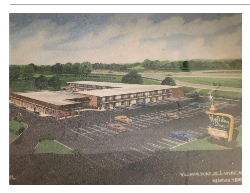
Figure 01: Architect's rendering of the hotel, ca. 1970