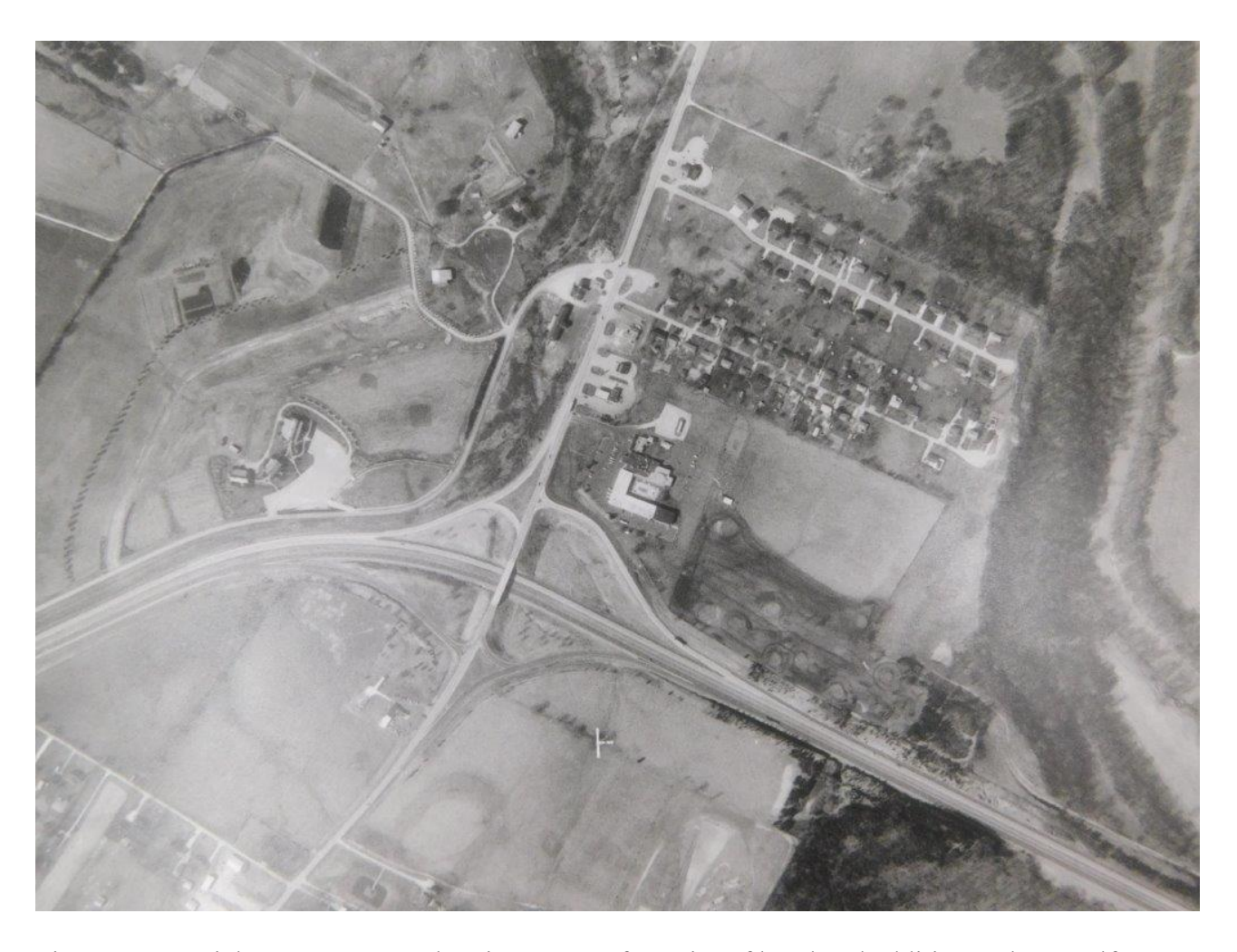
Figure 04: Aerial map ca. 1980s showing current footprint of hotel and additions, plus a golf course to the southeast that operated briefly.