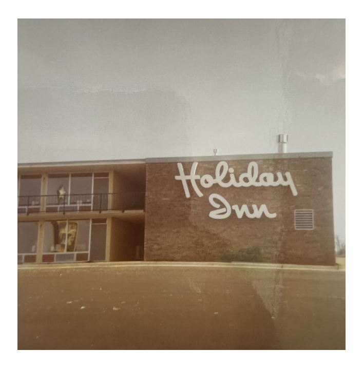
Figure 03: Holiday Inn building letters ca. 1970