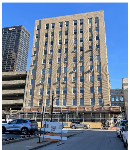
West elevation, Jefferson Co. Fiscal Court Building