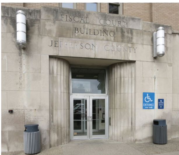
(Left) Looking up at decorative brick work above the main entrance; (Right) Main entrance, 2018 photo.

West elevation (photo next page): The west elevation runs along the east side of Sixth Street and displays Art Deco styling similar to what is seen on the southern façade with vertical strips of paired windows and decorative brick work in the spandrels. Limestone wall panels are also present on the ground floor along the sidewalk on this elevation, similar to the southern façade.