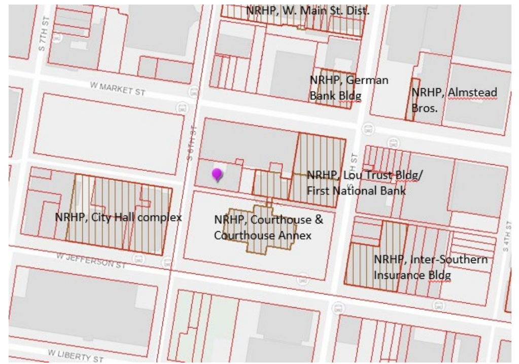
LOJIC.org basemap with National Register properties indicated by hashes; labels added by J. McCarron; purple marker indicates location of nominated property