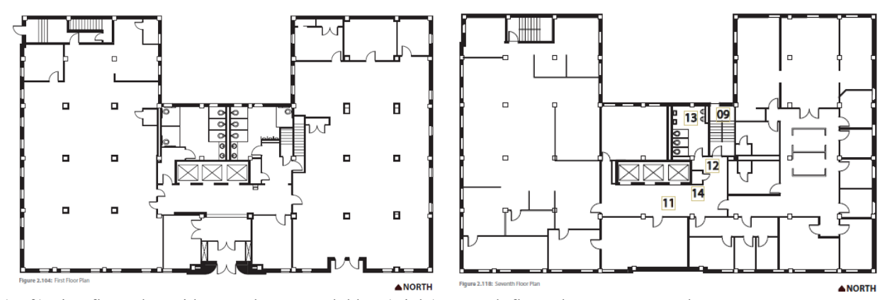
(Left) First floor plan with central entrance lobby; (Right) Seventh floor plan, as an example

The general floor plan shows a central elevator bank with common hallway and office wings on each side. There are two stair towers, one accessed from the elevator hallway, and one at the upper northwest area of the building with street access to the exterior on Sixth Street. The first floor has men's and women's restrooms centrally located, but the restrooms alternate men's and women's on each floor going up. The lobby entrance area on the first floor is used as office space on upper floors.