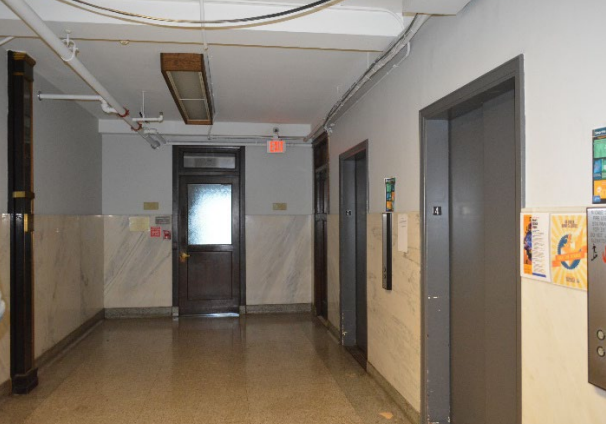
(Left) Elevator lobby at entrance level on first floor; (Right) Lobby on seventh floor