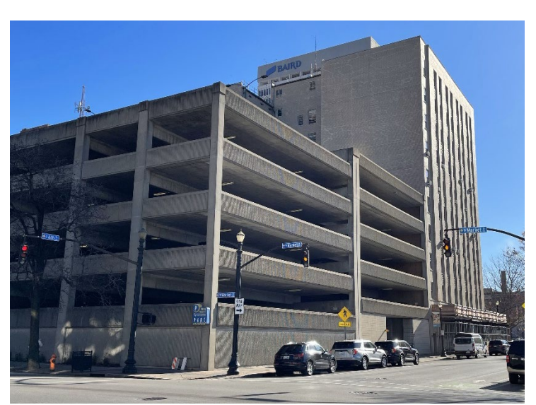
Looking towards building from corner of W. Market & Sixth St.