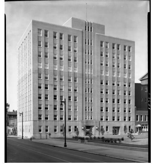
First six stories, December 1938