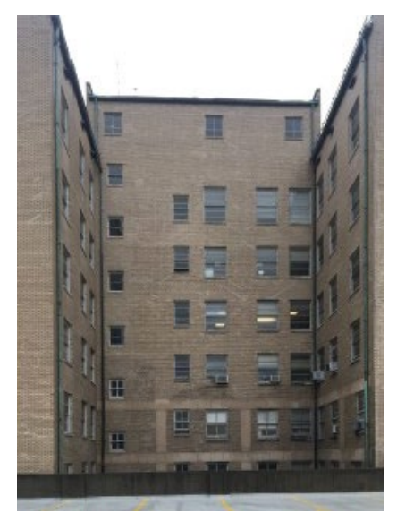
Windows on north elevation, 2018

North elevation: The building's U-shaped plan is evident on this elevation as a recessed portion of the north wall. Windows are present on the receding wall of the U-shape on this elevation, but there are no windows on the western third of the north face. The absence of the banded windows, seen on the south and west elevations, gives less articulation to the cornice of the building and makes the north side appear more utilitarian. Buildings fronting Market Street were present when the Fiscal Court Building was originally constructed. The top central section is the elevator penthouse. In the 1970s, a parking garage was built adjacent to the Fiscal Court Building's north wall but there is no parking garage access from inside the Fiscal Court Building. The garage is not part of the parcel or proposed boundary and stretches from the north wall to W. Market St.