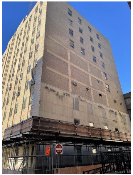
East elevation, Jefferson Co. Fiscal Court Bldg.

North elevation: The building's U-shaped plan is evident on this elevation as a recessed portion of the north wall. Windows are present on the receding wall of the U-shape on this elevation, but there are no windows on the western third of the north face. The absence of the banded windows, seen on the south and west elevations, gives less articulation to the cornice of the building and makes the north side appear more utilitarian. Buildings fronting Market Street were present when the Fiscal Court Building was originally constructed. The top central section is the elevator penthouse. In the 1970s, a parking garage was built adjacent to the Fiscal Court Building's north wall but there is no parking garage access from inside the Fiscal Court Building. The garage is not part of the parcel or proposed boundary and stretches from the north wall to W. Market St.