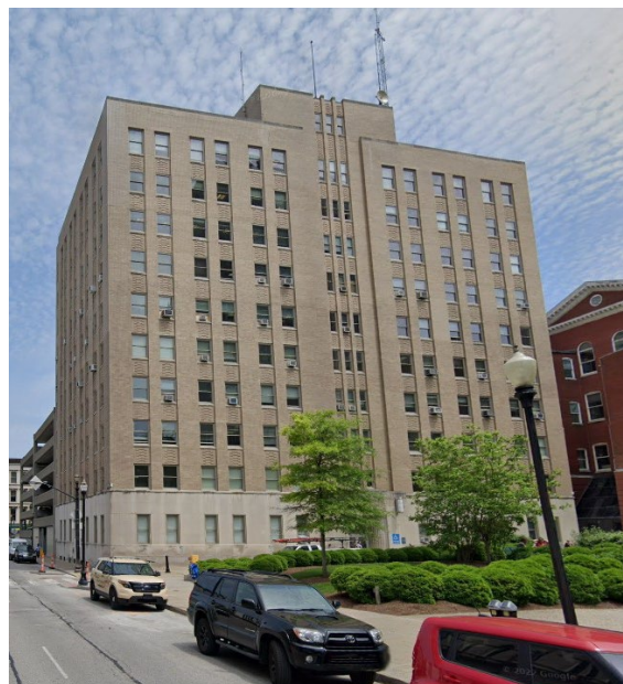
(Left) Fiscal Court Building location highlighted in red; (Right) 2019 Google street view of primary facade