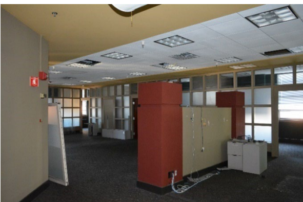
(Left) Office space on first floor, west wing; (Right) Office space on tenth floor, east wing