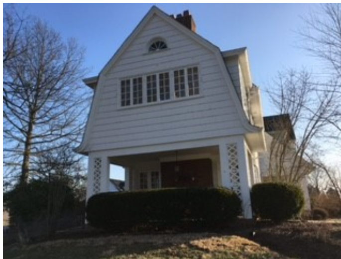
West Side façade