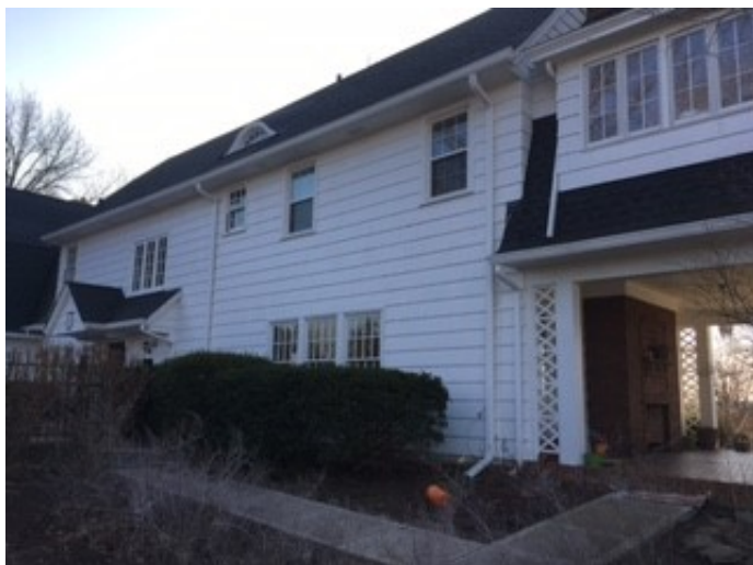
North side (back)

The house's large gambrel roof is most evident on the east side, as is the house's full two-floor height. A single dormer is visible on this side. The roof also has numerous gangs of triple 8-over-8-light double-hung sash windows. Windows and most doors were made of white pine.