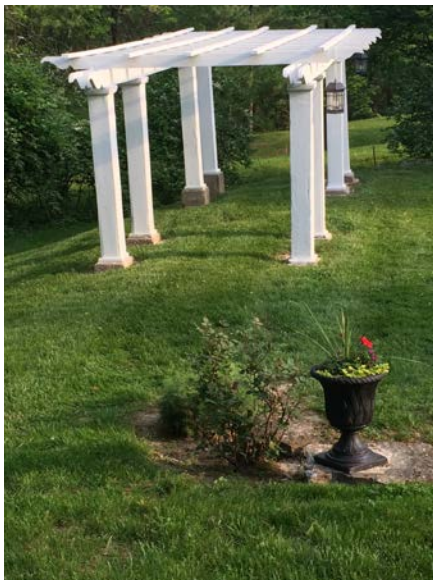
Current view of Pergola

The pergola has a concrete base and 8 wood columns and wooden planks on top.