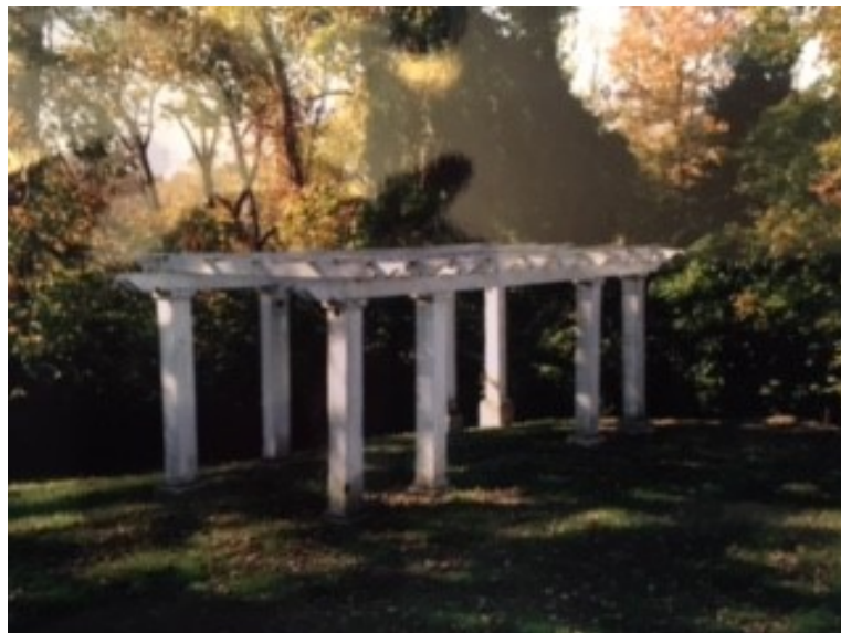
Historic view of Pergola published in a magazine