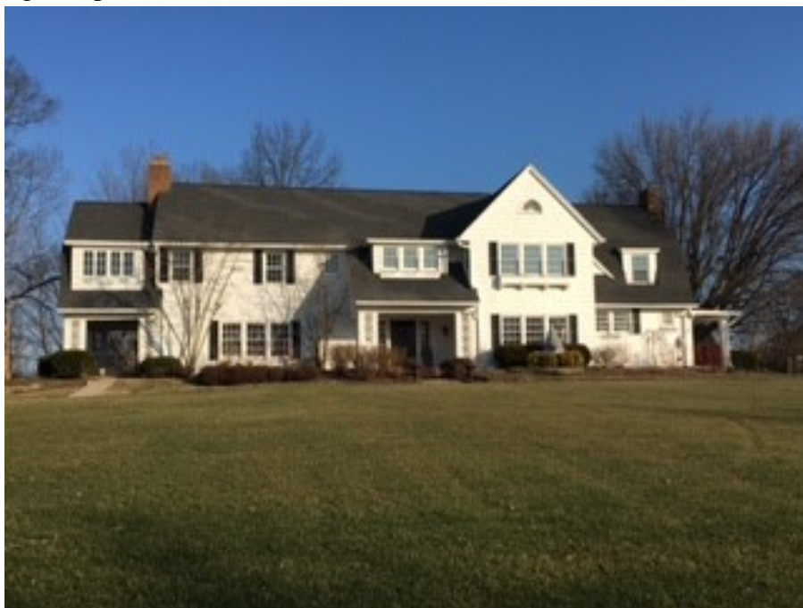
South (main) façade

house has many windows, several ganged in sets of three, others puncturing the wall singly, all with double-hung 8-over-8 wood sashes. Numerous porches, a porte cochere on the west, a bay-sized room, and dormers project from the main body of the house. The many projections and windows allow for a great deal of natural light to pass into the house.