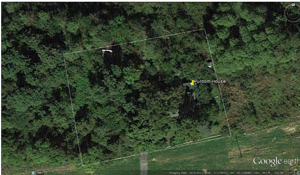
The 3-acre nominated area

The area proposed for listing is roughly rectangular. Its south side runs along the stone wall until it reaches the east side, made by rock fence that runs northward to a fence line behind the board and batten building, then westward on the north side to along the fence, past the gate, to the corner of the area where the barn stands, and then southward along the west boundary line of vegetation, along the orchard, marked by a line of shrubs, where it meets the stone wall.