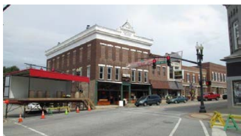
Central Block (at center)

Many examples of Italianate style architecture exist in the downtown section of Lebanon. Eighteen extant commercial buildings have Italianate features. Included in this outstanding grouping of Italianate architecture were the Central Block (built in 1888), City Hall, Hagan O'Daniel Drug Store, A. Borders and Sons (built in 1887), B.T. Conway Pool Room, Hilpp Bros. and Goodwin, and Clyde's Shoe Shop. A physical review of these building from the Kentucky Heritage Council's survey reveals that the Hagan O'Daniel Drugs Store's and B. T. Conway Pool Room have been remodeled. Clyde's Shoe Shop has been demolished and replaced with a new building. Such a large number of extant commercial buildings of mid- to late-19 th century suggests Lebanon's growing prosperity due to the advent of the railroad, and indicates that this downtown section escaped the fires that were the fate of many small town Kentucky business districts. xii Also interesting is the use of Italianate style later than the Purdom House's construction in 1884. Builders of the Central Block and Borders Building in Lebanon continued choosing the style, even though it had reached rural residential use. A style can be thought to have reached its maturity and possibly not be viewed as fashionable if elements of the style are applied to farmhouses. The continued popularity of Italianate style for downtown buildings through the 1880s indicates a long life-span for the style, and its great adaptability.