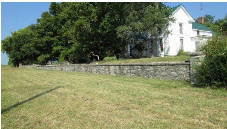
Purdom House, looking northwest

Marion County is located in central Kentucky in the Outer-Bluegrass Cultural Landscape. The Kentucky General Assembly formed Marion County out of the southern portion of Washington County on January 25, 1834. It was the 94 th county in order of formation. 1