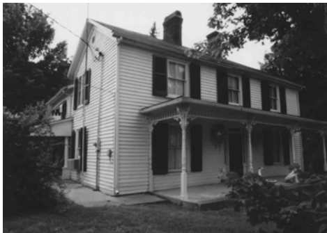
Bower House, Boyle County

Several plausible scenarios exist to account for the house's construction. Other Italianate residences in Marion County and the vicinity were constructed at an earlier date. A brick Italianate residence in Lebanon dates to 1878. xiv In Boyle County, east of Marion County, five properties with Italianate features were constructed between 1860 and 1876; these are listed on the National Register within the 1997 Boyle County Multiple Resource Area (MRA) nomination. These include the Bower House (c. 1867, NRIS 97001367) and the Willis Grimes House (c. 1860, NRIS 97001362), both located along the Lebanon-Danville Turnpike. Two of the five houses are frame structures, the Bower House and the Yeager House (c. 1870, 97001352). These houses are vernacular interpretations of the Italianate style, similar to the Purdom House. xv