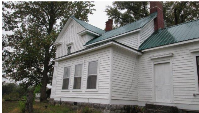
East side addition

A flat-roof addition with squared mortar stone foundation extends from the east side of the one-and-one-half story ell. Though the foundation and roof treatment dates it to the early-20 th century, the addition has three six-over-six double-hung windows on its east side. A small window exists about this addition on the east side of the one-and-one-half story portion and a similarly located window is found on the west side. These two windows, the centered upper window on the south façade, the replacement window on the north side of the one-story portion, and the window on the north side of the lean-to-addition, all appear to date to the early-20 th century. Also in the early-20 th century, a porch was added to the rear (north) side of the house. That porch wraps around to the west side of the one-and-one-half-story addition.