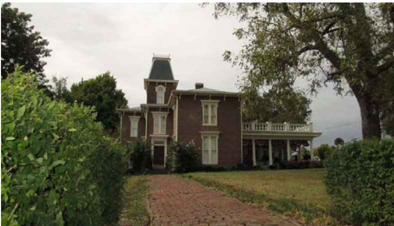
Boldrick-Wathen House (1842)

The purest examples of the style in the survey area are found in the larger towns, as at the 1842 Boldrick-Wathen House near Lebanon (MNL-12) or the 1884 Covington Teacher's Institute in Springfield (NR 1983, NRIS 83002890). More than 40 years separate the two constructions, illustrating that although the style is introduced by the middle of the nineteenth century, its influence continues locally for some time.