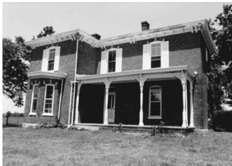
Willis Grimes House