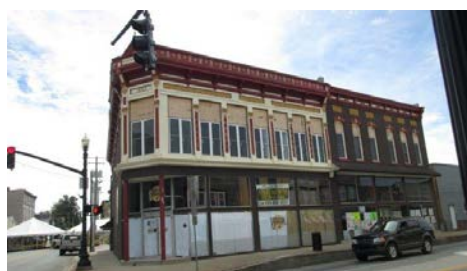
Borders and Son