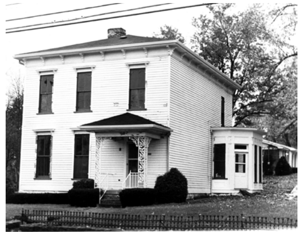
Covington Teacher's Institute in Springfield (1884)

In Kentucky, the tall and narrow window proportion becomes particularly pervasive, continuing to show up even on extremely modest dwellings of the early-20 th century, as at an unnamed house on White Oak Branch Road near Bradfordsville (MN-604) and at the Heel House (WS-453). Perhaps it is a bit of a reach to associate those two examples with the style, but in the survey area, examples of