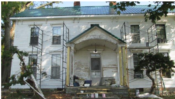
South side, main façade

Marion County, Kentucky County and State