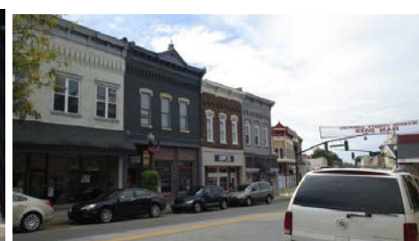
Several Lebanon Buildings