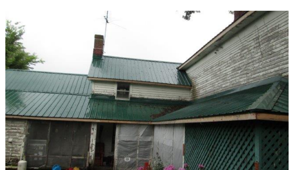
Ell (at left) and North side

The house has a one-bay-wide one-story porch with a gable roof, and serves as the house's main entrance. The door is a door dating to the 1880s, which is accented by a transom with oval glass.