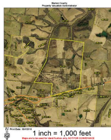
The farm's 244-acre area in yellow

The site of the Purdom House includes a stone wall and steps leading from the old US 68 to the house, and a stone wall along US 68. The stone wall with mortar extends for about 200 feet in front of the house, beginning about 50 feet west of the drive. The stone wall curves in to the drive and curves in to the stone steps that lead to the stone path to the house. This wall is similar to the foundations of the sections of the house that appear to date to the early-20 th century, and it probably also dates to this period. This stone wall probably replaced an older dry laid rock fence. This type of rock fence extends further east along US 68, adjoining the stone wall, for approximately an additional 200 feet. This was the only dry-laid rock fence observed along US 68 in the immediate vicinity.