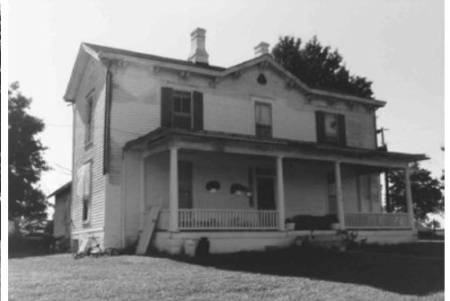
Samuel Yeager House